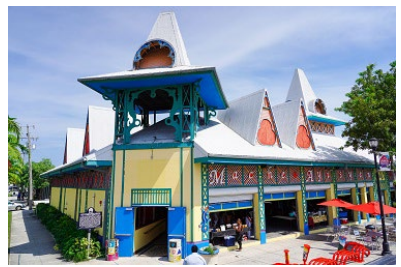
Image of the Little Haiti Cultural Center

include: Family Fest (Presenting Sponsor: Baptist Health), a season of free performances featuring the world's leading family-friendly artists; The Heritage Project (Presenting Sponsor: Bank of America), a free salon series and annual festival featuring panel discussions surrounding performing arts and social justice in the community; AileyCamp Miami, a full-scholarship, six-week summer dance camp which uses dance as a vehicle for the personal development of young people; CommuniTea Dance, an annual celebration honoring Miami's LGBTQ+ community; Knight Masterworks Classical Conversations, a series of free lectures which give the audience insight into the musicians, composers and history of music presented in our Knight Masterworks Classical Music series; Accessing the Arts Residencies, art workshops for children and adults with disabilities; and Arsht on the Road (Presenting Sponsor: TD Bank), a series of free pop-up performances that bring the arts into Miami-Dade County's diverse neighborhoods.