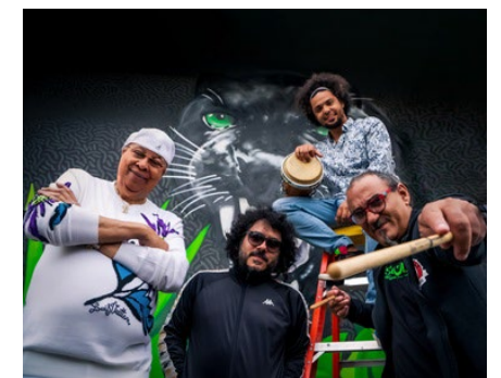
Image of Chucho Valdés and The Royal Quartet