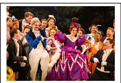
"Beggars at the Feast" from Les Misérables