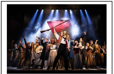
"One Day More" from Les Misérables

free with a ticket to that evening's performance.