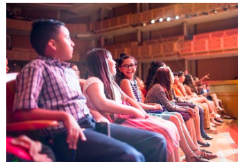
Image of Miami-Dade County Public Schools students enjoying a performance of Kitty Hawk at the Arsht Center

To download hi-res versions of the images above, click here .